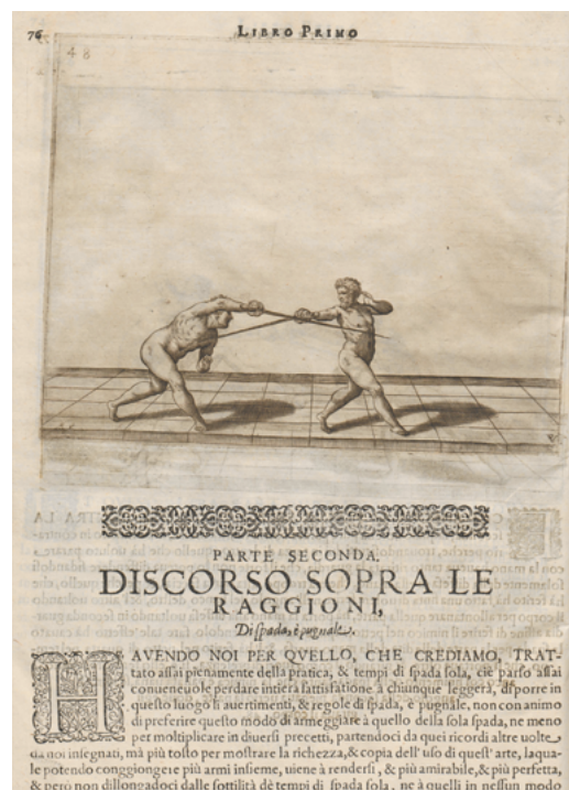
De lo schermo overo scienza d'arme , by Salvator Fabris, 1606.

The digitization of these early works enables modern researchers to have around-the-clock global access to once hard-to-access materials.