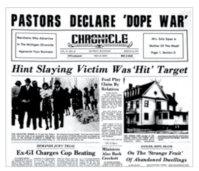
Black, B. (1973, Mar 24). Hint Slaving Victim Was 'Hit' Target: Foul Play Claim By Relatives. Michigan Chronicle (1939-Current)

Research a topic from every angle, across time and geography. With ProQuest Historical Newspapers, ProQuest Recent Newspapers and ProQuest Global Newsstream-all cross-searchable on the ProQuest platform-researchers access unprecedented coverage of people, places and events from the earliest newspaper publications to current-day reports.